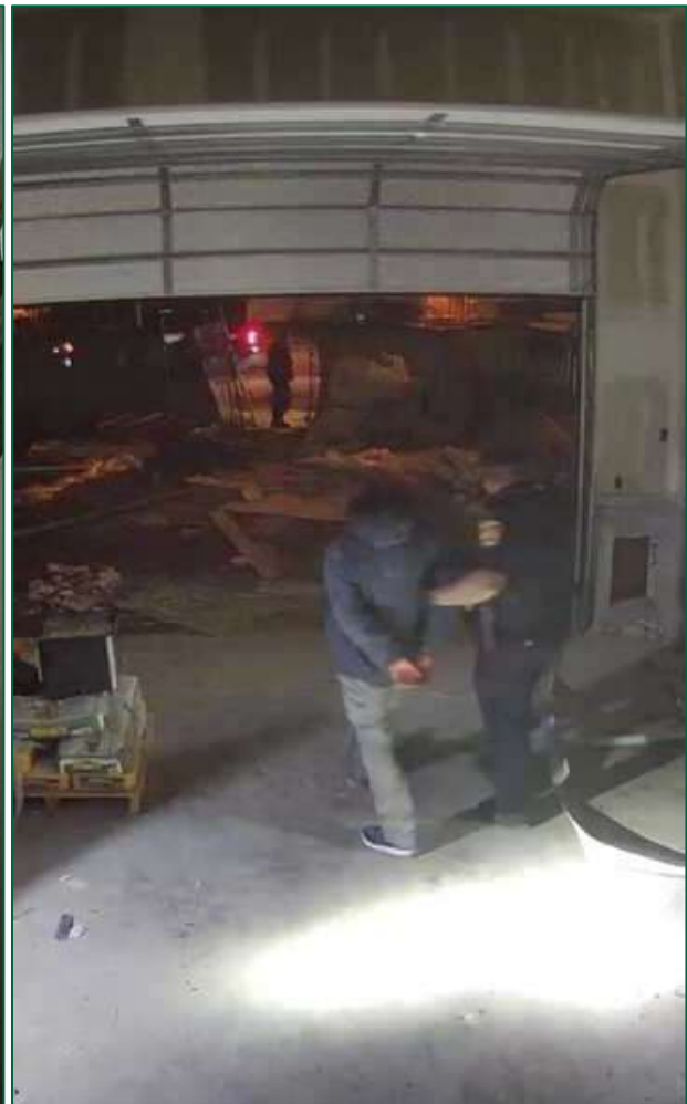
On December 4, 2022 officers arrested a suspect stealing materials from a home under construction. The suspect was arrested and charged with Burglary of a Building.